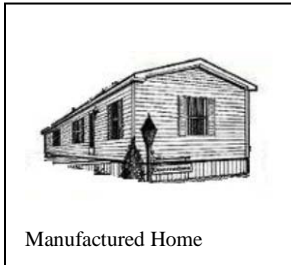
Included in the Settlement

A court authorized this notice. This is not a solicitation from a lawyer.